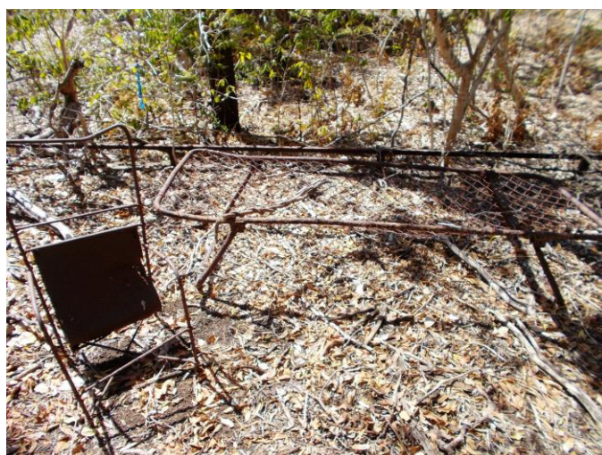
Metal chair and bed