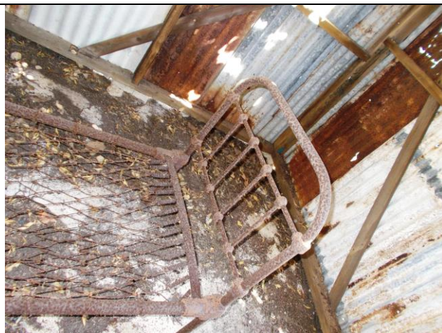
Metal bed inside the hut