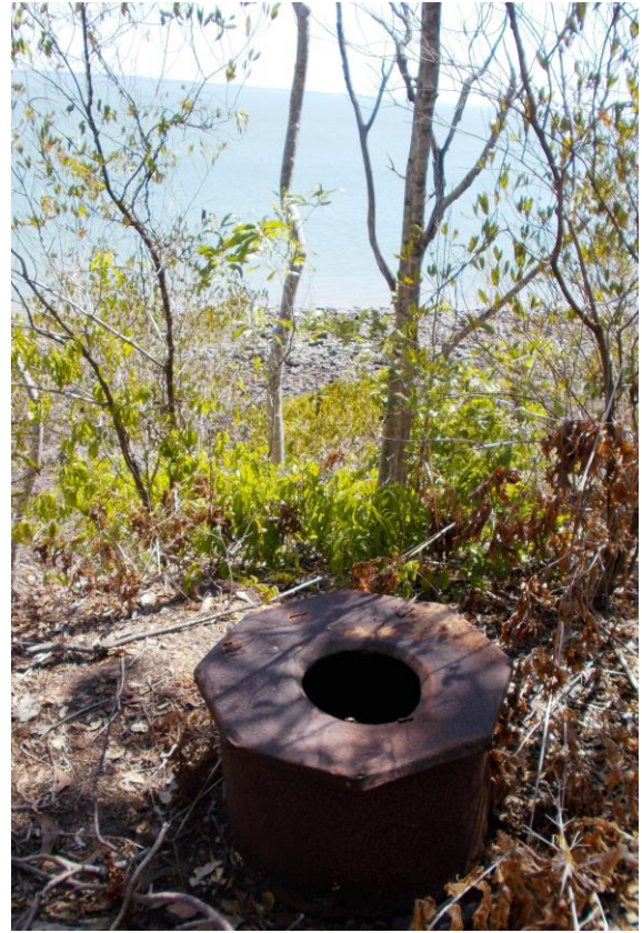
Metal toilet - flaming fury with a sea view