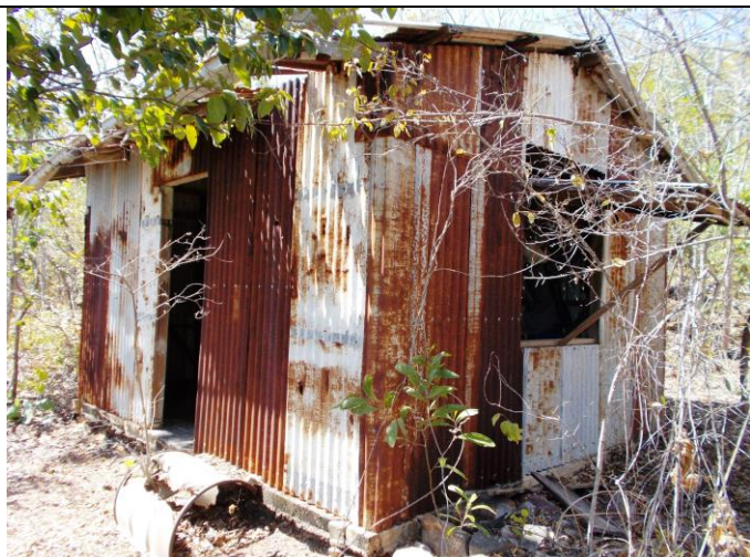
Corrugated iron hut

The site is very overgrown with only a couple of corrugated iron huts still standing. Two sweet possums had made their home in one of them. Foundations of buildings were still very visible with several sets of stairs that led to nowhere. The jetty had been built with stone and covered in concrete but much of the concrete had crumbled away. Metal beds, chairs and cabinets were scattered in the bush. A pleasant find was a beautiful stone and brick fire place complete with chimney.