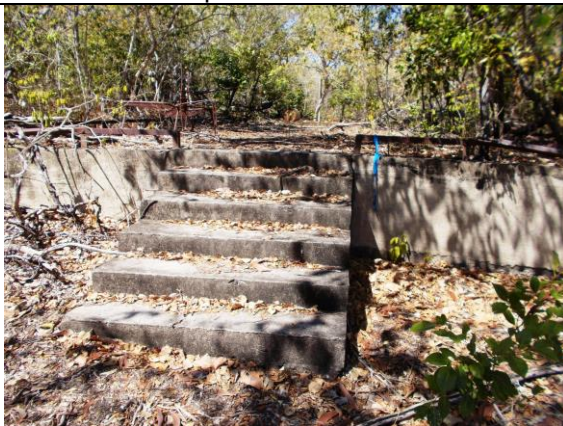
Steps that led to nowhere