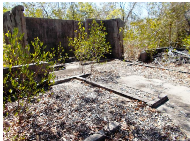
Foundations from the quarantine station