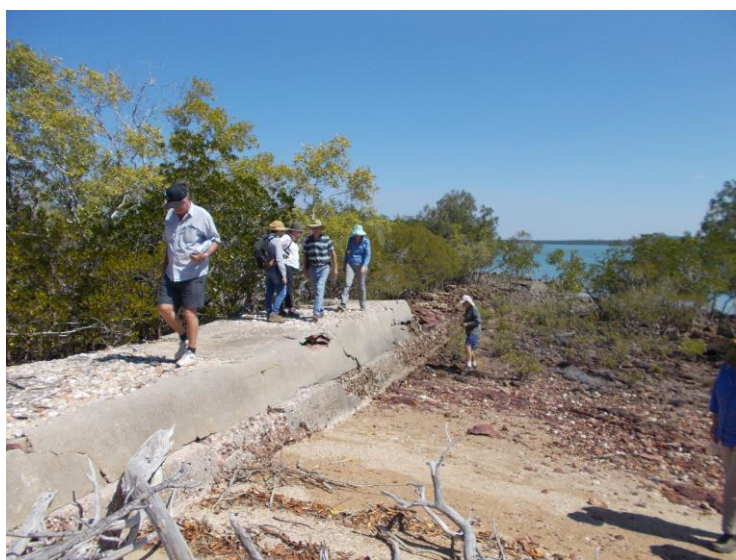
The stone and concrete jetty