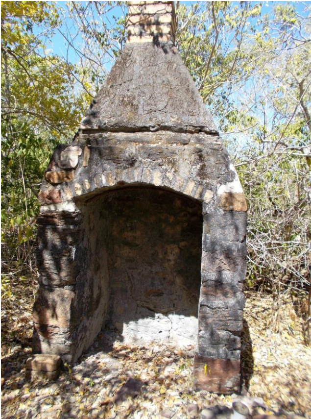
Stone and brick fire place